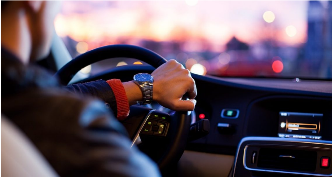
Looking into the Challenges of the Driverless Car Industry